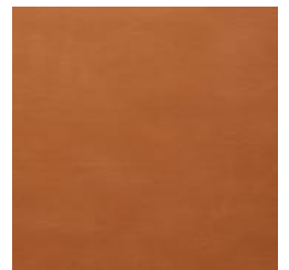
SVI 104 LUGGAGE