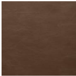
SVI 005 ENGLISH TOFFEE