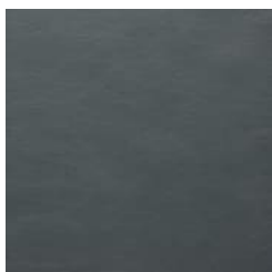
SVI 105 MINERAL