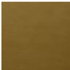
SVI 015 WICKER