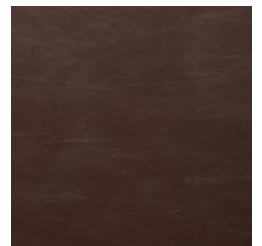
SVI 014 TOBACCO