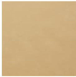
SVI 002 CHAMOIS