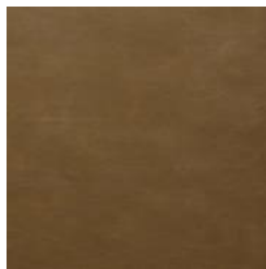
SVI 012 PRETZEL