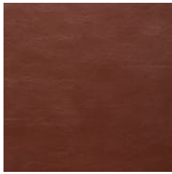
SVI 001 ALE