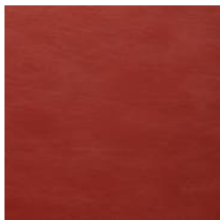
SVI 010 PAPRIKA