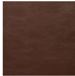
SVI 008 OLD BRONZE