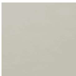
SVI 106 WHISPER