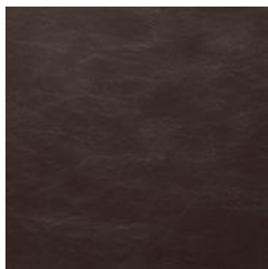
SVI 011 PORT