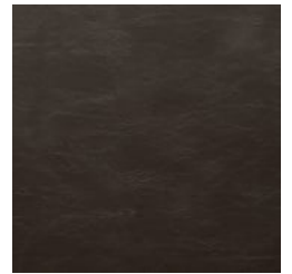
SVI 009 OLD COUNTRY