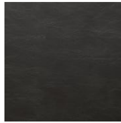
SVI 003 COAL