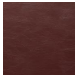
SVI 013 SHERRY