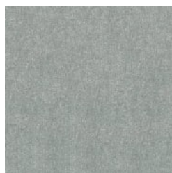
31 DUCK EGG