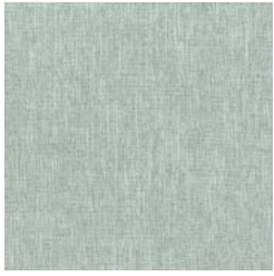
31 DUCK EGG