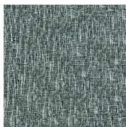
31 BLUE MIST