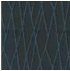
24 DEEP TEAL