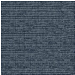
JEFFE 309 INDIGO