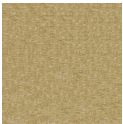
JEFFE 655 MAIZE