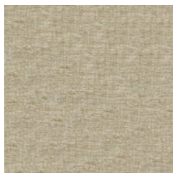
JEFF 6004 BUFF