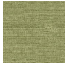
JEFFE 202 ABSINTHE