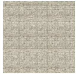
JEFFE 67 COSMIC LATTE