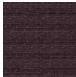
JEFFE 1009 ZANTIUM