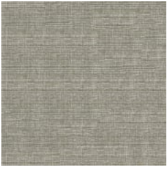
JEFF 9003 GAINSBORO