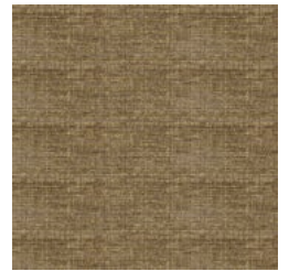
JEFFE 608 BEIGE