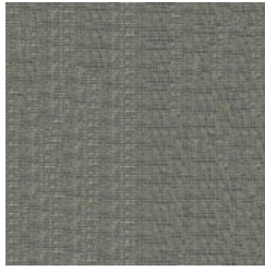
JEFF 9006 BATTLESHIP GREY