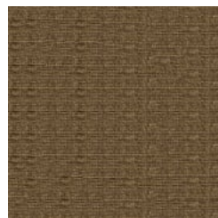
JEFF 6009 COCOA