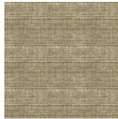
JEFFE 605 PARCHMENT