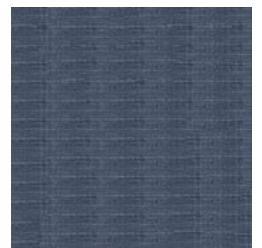
JEFFE 3003 PLACID BLUE