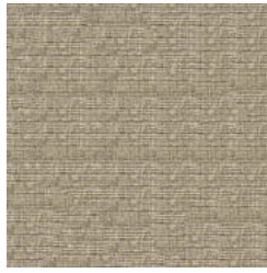
JEFFE 103 WISTERIA