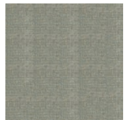
JEFF 7003 SEABREEZE