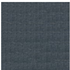
JEFFE 3006 DENIM BLUE