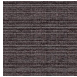
JEFFE 105 RAZZMIC BERRY