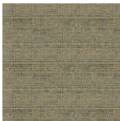
JEFFE 708 FLATTERY