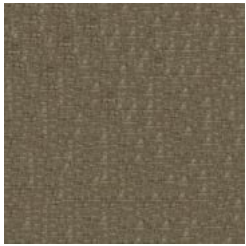
JEFFE 82 STONE