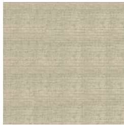
JEFFE 602 CORNSILK