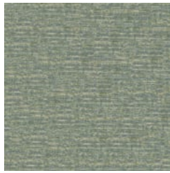
JEFFE 22 CELADON