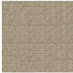
JEFFE 103 WISTERIA