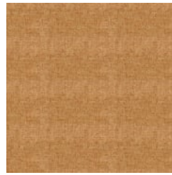
JEFFE 44 CELESTE ORANGE