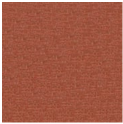
JEFFE 14 PEONY