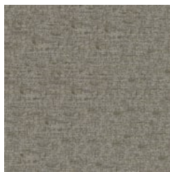
JEFFE 902 STUCCO