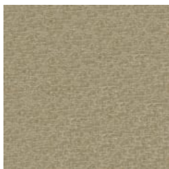
JEFF 6003 OATMEAL