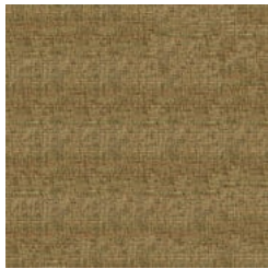
JEFFE 405 PUMPKIN SPICE