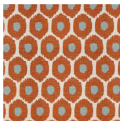
1011302 TIGER LILY