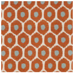
1011302 TIGER LILY