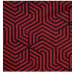
437 TUSCAN RED