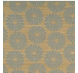
61703 ROBIN'S EGG