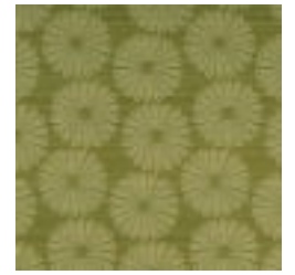
61702 GRANNY SMITH