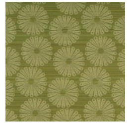
61702 GRANNY SMITH