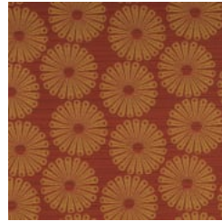
61708 RED DELICIOUS