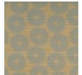
61703 ROBIN'S EGG