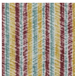
1010928 ENDLESS SUMMER