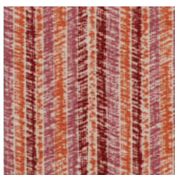
1010927 PEACH PIT