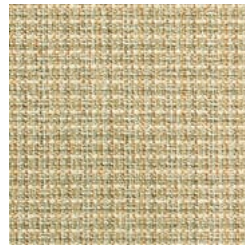
1008995 BUTTER PECAN