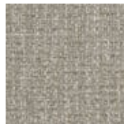
1011040 LONDON FOG