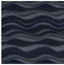
3009 MIDNIGHT BLUE