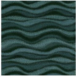
24 DEEP TEAL