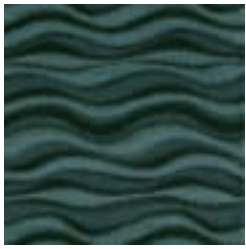
24 DEEP TEAL