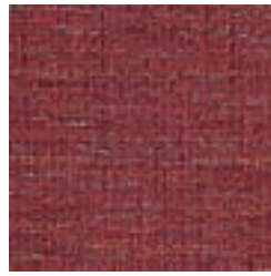
1011207 FRUIT PUNCH