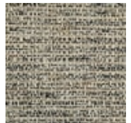
1011224 CAF AU LAIT