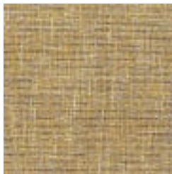
1011211 GOLDEN HOUR