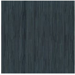
24 DEEP TEAL