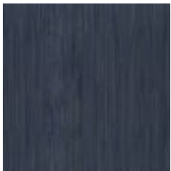
308 MOODY BLUE