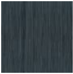
24 DEEP TEAL