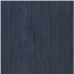
308 MOODY BLUE