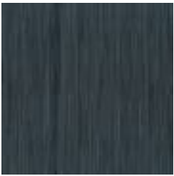
24 DEEP TEAL