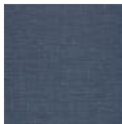
P3T-60288 DEEP INDIGO