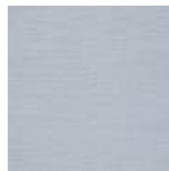
P3T-60289 BLUE BELL