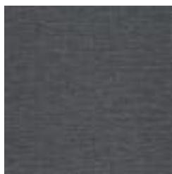
P3T-60287 INK WELL