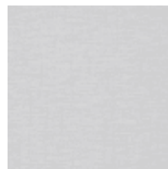
P3T-60284 FRESH WHITE