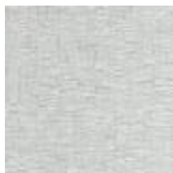
P3T-60285 NOBLE GREY