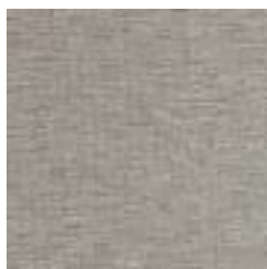
P3T-60282 ANTIQUE SILVER