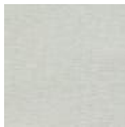
P3T-60273 BLUE SAGE