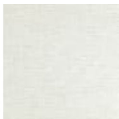
P3T-60280 SILVERY MIST