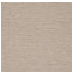
P3T-60281 DUSTY TRAIL