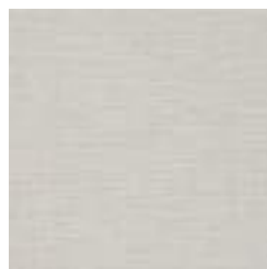
P3T-60283 LIGHT GREIGE