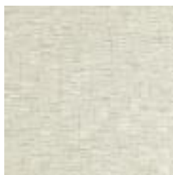
P3T-60277 SUNSHINE SAND