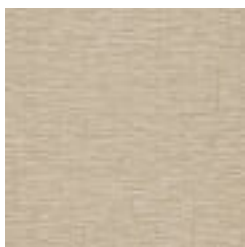
P3T-60276 PALE AMBER