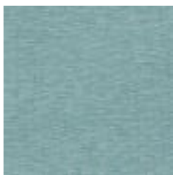
P3T-60271 SEA GREEN