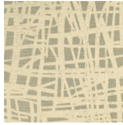
P3T-60149 TAKE AWAY TAN