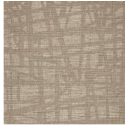
P3T-60148 THE RUB