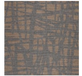
P3T-60147 GREY LEAD