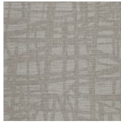
P3T-60153 SILVER SCRATCH