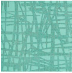
P3T-60145 BERYL BLUE

Wallcoverings » Advanced Wall Protection