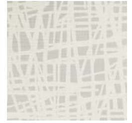
P3T-60151 WHITE OUT