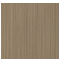
P3T-60116 OILED BRASS