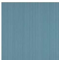
P3T-60102 CLEAR BLUE