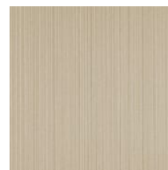
P3T-60114 ROYAL CREAM