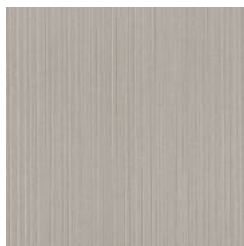
P3T-60107 SILVER WASH