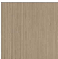
P3T-60111 RAW SUGAR