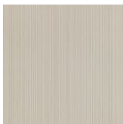
P3T-60112 BONE WHITE