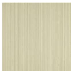
P3T-60100 FRESH PEAR

Wallcoverings » Advanced Wall Protection