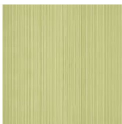
P3T-60101 EARLY SPRING