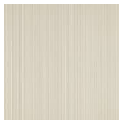
P3T-60113 WINTER IVORY