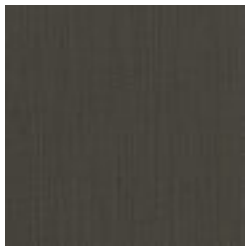
BB-LG-06 KYANITE BLACK