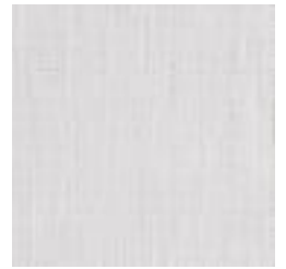
BB-LG-04 SELENITE WHITE