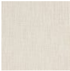
BB-LG-01 CREAM CONE