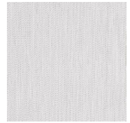
BB-LG-04 SELENITE WHITE