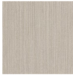
BB-LG-02 GREIGE GEAR