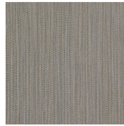
BB-LG-03 CHANTON SHADOW