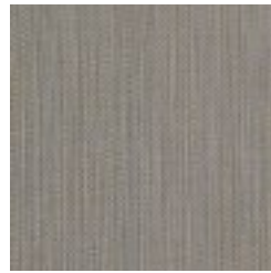
BB-LG-03 CHANTON SHADOW