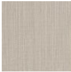
BB-LG-02 GREIGE GEAR