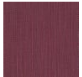
BB-LG-09 FUSCHIA FACET