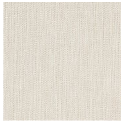
BB-LG-01 CREAM CONE