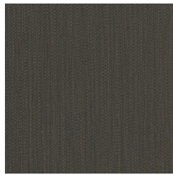
BB-LG-06 KYANITE BLACK