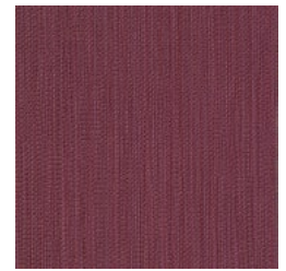
BB-LG-09 FUSCHIA FACET