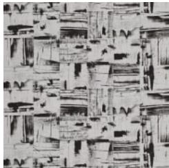
BB-BK-06 CALA LILY