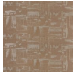
BB-BK-03 EWOLDSEN TRAIL