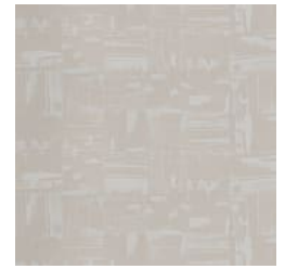
BB-BK-04 SAND DOLLAR