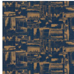
BB-BK-07 MCWAY NAVY