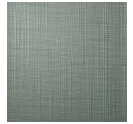
A196-206 EGYPTIAN GLASS