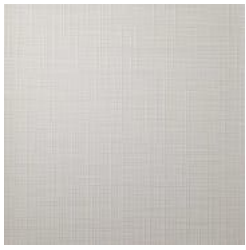
A196-001 WHITE LANTERN

Wallcoverings » Commercial Wallcoverings