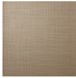
A196-026 TEA HOUSE