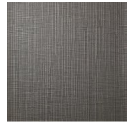
A196-588 VICTORIA FALLS