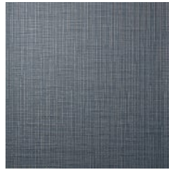
A196-370 IMPERIAL KNIGHT