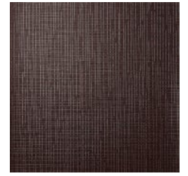
A196-418 BERRY GLACE