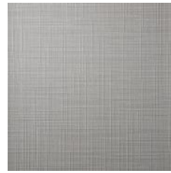
A196-540 SILVER MOON