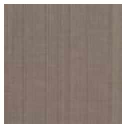
BX4403 LATTICE METAL