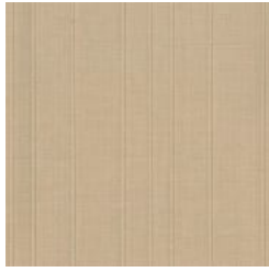
BX4398 CRASH PAD