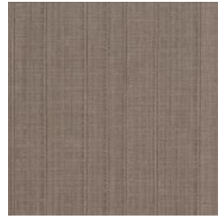
BX4403 LATTICE METAL