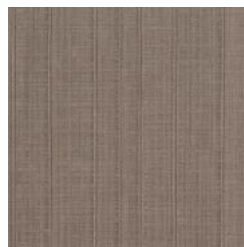
BX4403 LATTICE METAL