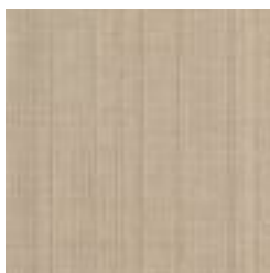
BX4402 CUT LOOSE