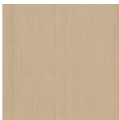
BX4398 CRASH PAD