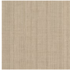
BX4402 CUT LOOSE