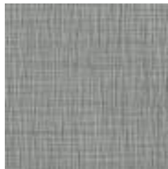
BB-DW-16 HARBOR HAZE