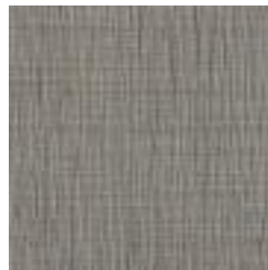
BB-DW-18 FOX HOLLOW