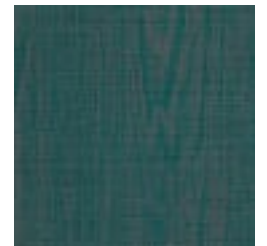
BB-DW-20 BLUSHING SPRUCE