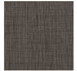
BB-DW-12 NOCTURNAL GRAY