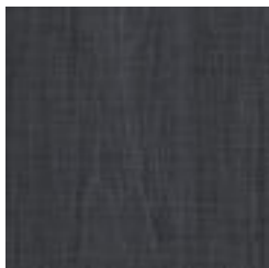
BB-DW-21 MYSTIC BLUE