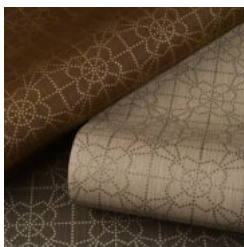
embellish-promo- rs1023-rs1022- rs1021.jpg