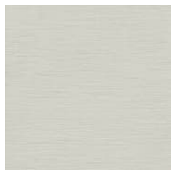
BB-FB-21 GLASGOW SNOW