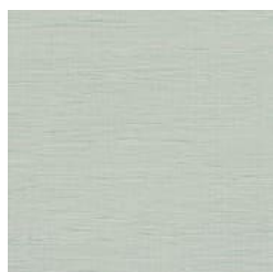
BB-FB-31 CELTIC SEA