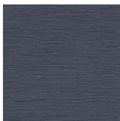
BB-FB-33 BALLYBAY BLUE