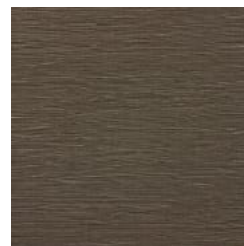
BB-FB-25 CHOCOLATE MAPLE