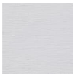
BB-FB-19 WASHED WHITE