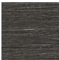
BB-FB-18 DOUBLE BASS