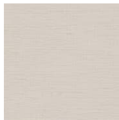
BB-FB-24 BONE TIMBER