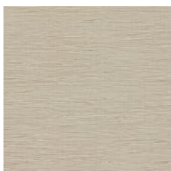
BB-FB-27 BRONZE GROOVES