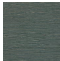
BB-FB-30 EMERALD ISLE