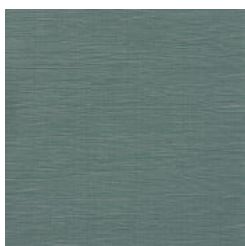
BB-FB-32 SAGE BLUE SONG