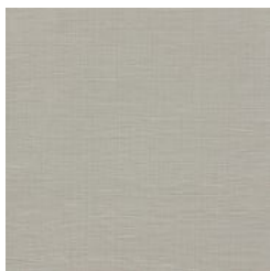
BB-FB-22 WOLFHOUD GREY