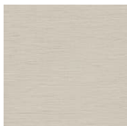
BB-FB-26 IRISH CREAM