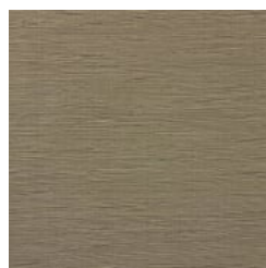
BB-FB-29 OLIVE CLOVER