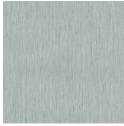
G222-40 STILL POND