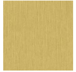
G222-80 WOMAN IN GOLD