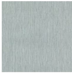
G222-40 STILL POND