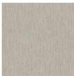
G222-53 BIRCH FOREST