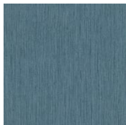
G222-75 PORTRAIT OF A LADY