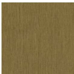
G222-57 GOLD LEAF