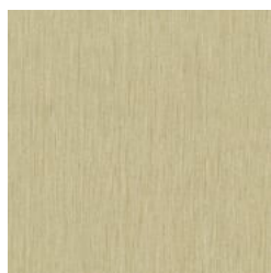
G222-82 APPLE TREE

Wallcoverings » Commercial Wallcoverings