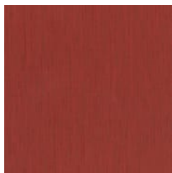
G222-70 RED HILDA