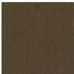
G222-60 RAW UMBER