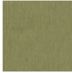
G222-88 TREE OF LIFE