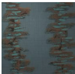
A174-343 SECRET GARDEN