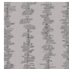
A174-817 GRAY HERON