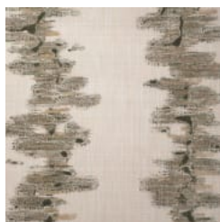
A174-856 ROCKPORT GRAY