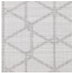
AZ52515 LL COOL GREY