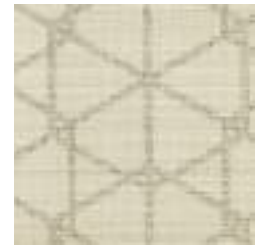
AZ52521 FUNKY WHITE