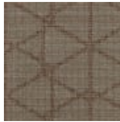
AZ52516 MOCHA FLAVA