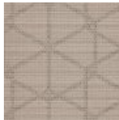
AZ52890 DJ TAUPE