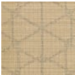
AZ52522 NATURAL FREESTYLE