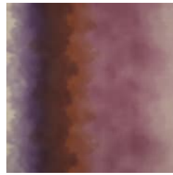
AZ53207 DAZZLING DUSK