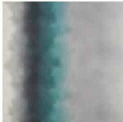
AZ53210 OCEAN FOG