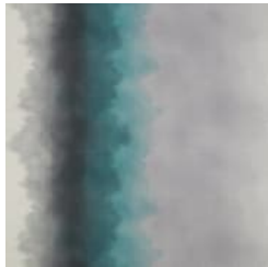
AZ53210 OCEAN FOG