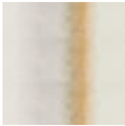
AZ53205 AFTERNOON CALM