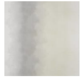
AZ53208 MORNING CLOUD