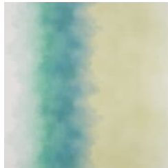
AZ53211 VIVID CLOUD