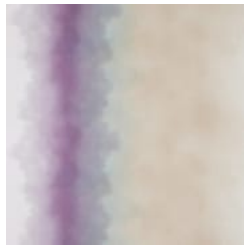
AZ53206 PAINTED HORIZON