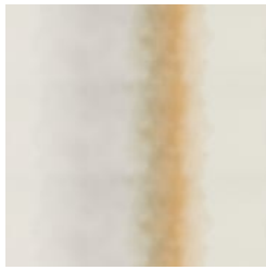
AZ53205 AFTERNOON CALM