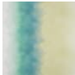
AZ53211 VIVID CLOUD