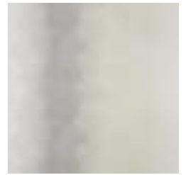
AZ53208 MORNING CLOUD