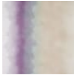
AZ53206 PAINTED HORIZON