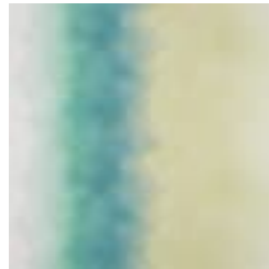
AZ53211 VIVID CLOUD