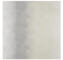
AZ53208 MORNING CLOUD