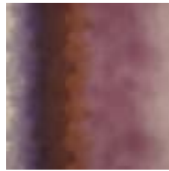
AZ53207 DAZZLING DUSK