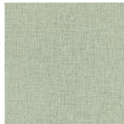
BB-TW-17 PALE POWDER