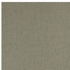
BB-TW-22 SILVER SCRATCH