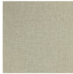
BB-TW-04 GILDED ASH