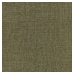
BB-TW-23 GREY LEAD