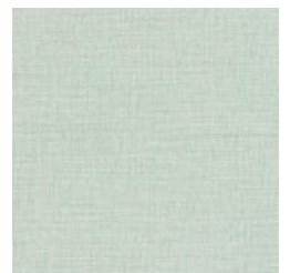
BB-TW-25 SPRING CLEAN