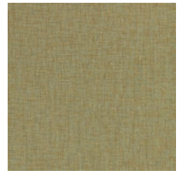
BB-TW-05 NEUTRAL FLAKE