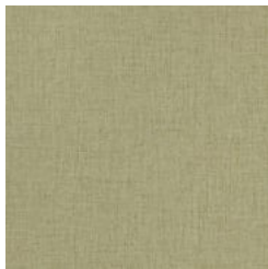
BB-TW-11 SCoured GOLD