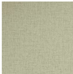
BB-TW-16 WHITE OUT