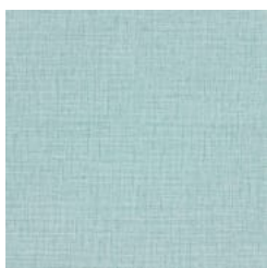
BB-TW-26 COOL BREEZE