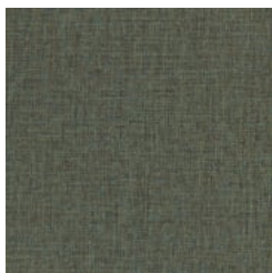
BB-TW-20 BLUE SWIPE