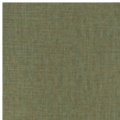
BB-TW-15 BRASSY OLIVE