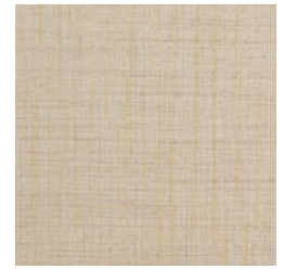
SG04-04 LEMON TWEED