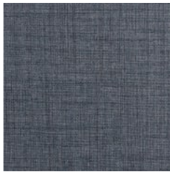
SG04-10 DAPPER DENIM