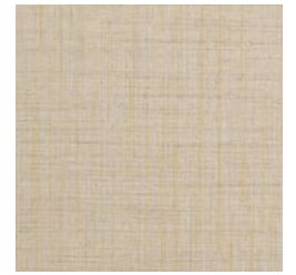
SG04-04 LEMON TWEED