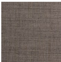
SG04-16 BRONZE BOUCLE