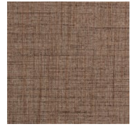
SG04-09 NATURAL LEATHER