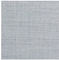
SG04-05 BLUE TAFFETA