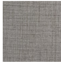
SG04-13 GREY GABARDINE