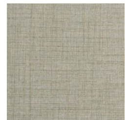
SG04-19 SAGE SUEDE