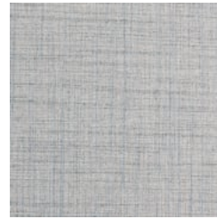
SG04-08 SILVER SATIN