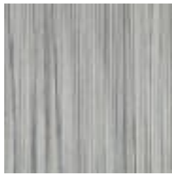
W2-MV-08 NICKEL SHELTER