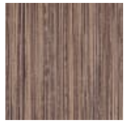
W2-MV-15 RIBBED RUST