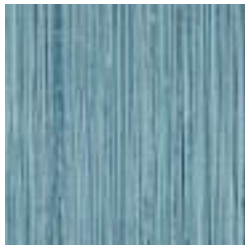
W2-MV-02 CISTERN BLUE