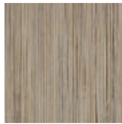
W2-MV-14 GOLD CREST