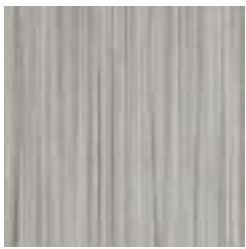
W2-MV-11 TIN TRUSS