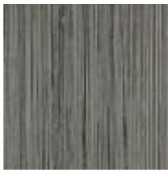
W2-MV-12 IRON HOOD