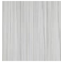
W2-MV-04 WHITE WASH