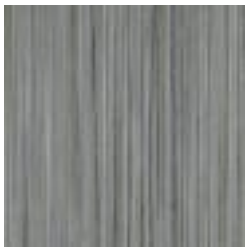
W2-MV-06 GALVANIZED GREY