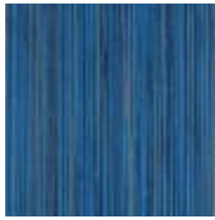
W2-MV-03 COBALT CREASE