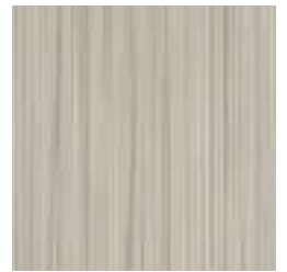
W2-MV-10 RIDGED BUFF