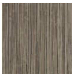
W2-MV-18 DARK BRONZE