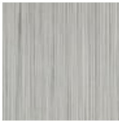
W2-MV-07 SKYLIGHT PEARL