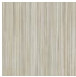
W2-MV-13 WARM GLIMMER