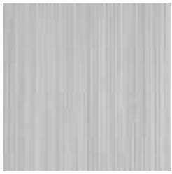
W2-MV-01 ALUMINUM ROOF