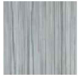
W2-MV-05 CHROME COVER