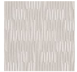
BX4483 GREY WOLF