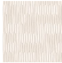
BX4482 CRYSTAL ROD