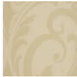
AZ52468 BACKSTAGE BEIGE