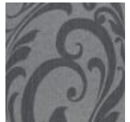
AZ52930 CLASSICAL CHARCOAL