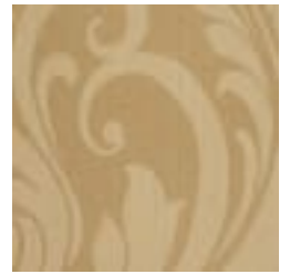
AZ52469 TAN HALEN