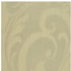
AZ52471 ELECTRIC GREEN