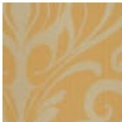
AZ52472 GOLD RECORD