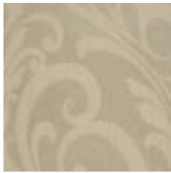
AZ52466 ERIC PLATINUM