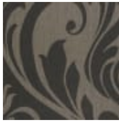
AZ52467 BLACK SABBATH