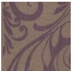
AZ52931 PURPLE PRELUDE