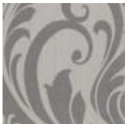
AZ52932 SILVERWAY TO HEAVEN