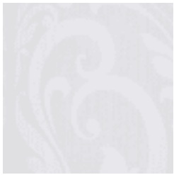
AZ52465 THE WHITE ALBUM