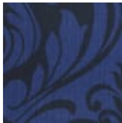
AZ52473 THE INK SPOTS