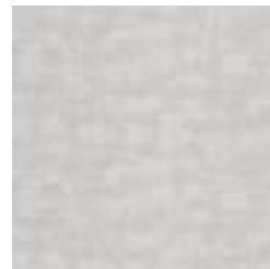
AZ53535 ROCKS OFF