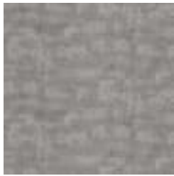
AZ53536 HEART OF STONE