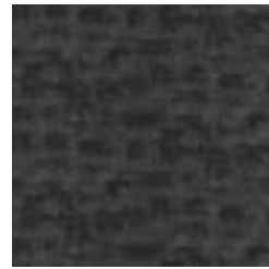
AZ53538 PAINT IT BLACK