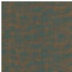
AZ53541 JUMPIN JACK FLASH