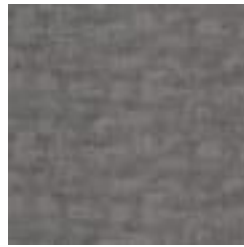
AZ53537 STANDING IN THE SHADOW