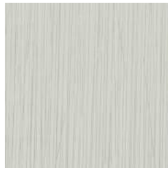
W2-SB-01 CLOUDY SHIMMER