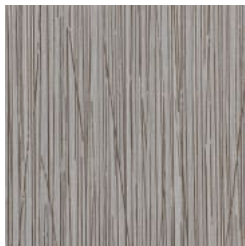
W2-SB-05 CINDER SHADOW