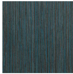
W2-SB-02 BLUE CARBON