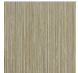
W2-SB-09 GOLDEN SAGE