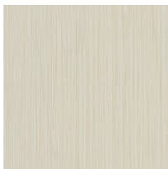
W2-SB-10 LINEN LUSTER