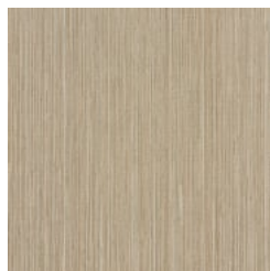
W2-SB-11 GLIMMERING SAND