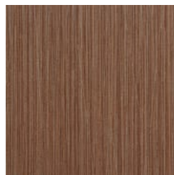
W2-SB-12 COCOA BUTTER