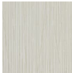
W2-SB-07 WARM & CLOUDY