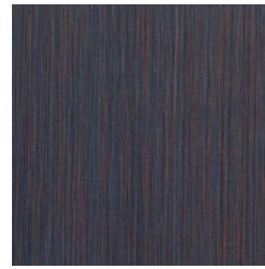
W2-SB-03 RUSTED NAVY