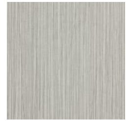
W2-SB-04 SILVERY FROST