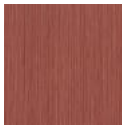
W2-SC-17 RED MAPLE