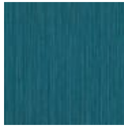
W2-SC-02 BLUE WAVE