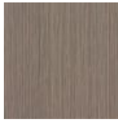
W2-SC-12 SMOKEY TAUPE