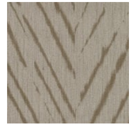
SG22-03 GARDEN PATH