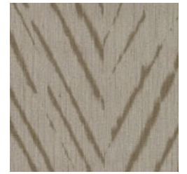
SG22-03 GARDEN PATH