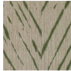
SG22-09 PEAR TREE