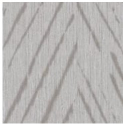
SG22-07 WATER CASTLE