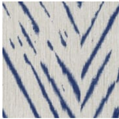
SG22-01 INDIGO WATERS