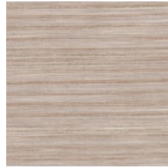
BB-SK-14 GOLDEN SUNSET