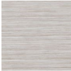
BB-SK-08 SATIN GREY