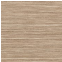
BB-SK-17 CREME BRULE