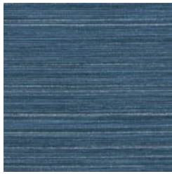
BB-SK-03 COOL MIST