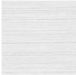
BB-SK-07 WHITE FROST