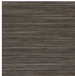
BB-SK-25 SHIMMER BLACK