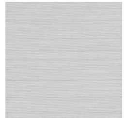
BB-SK-32 PALE SILVER