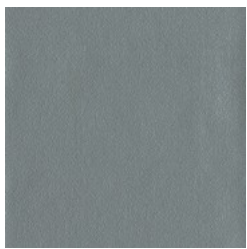
MCO2095 HIGH RISE

Wallcoverings » Commercial Wallcoverings