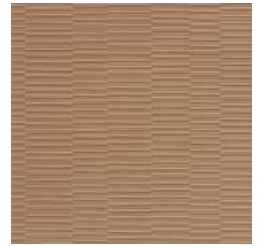
W2-ST-09 SHEER TAUPE