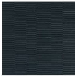
W2-ST-06 NIGHT BLUE