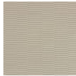
W2-ST-08 SOLID PEWTER