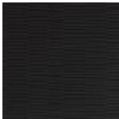
W2-ST-03 BLACK LACQUER