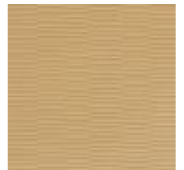
W2-ST-14 AZTEC GOLD