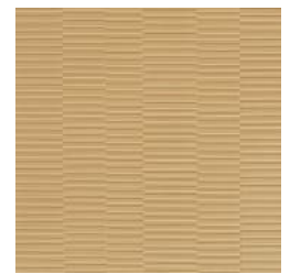
W2-ST-14 AZTEC GOLD