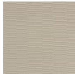
W2-ST-08 SOLID PEWTER