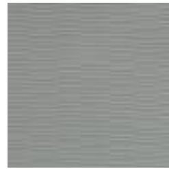
W2-ST-02 GLIMMERING GREY