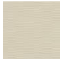
W2-ST-13 FAIRY DUST