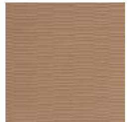
W2-ST-09 SHEER TAUPE