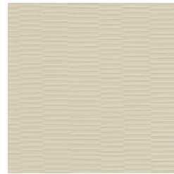
W2-ST-13 FAIRY DUST