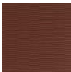
W2-ST-17 RUSTY RED