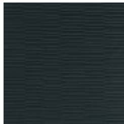
W2-ST-06 NIGHT BLUE