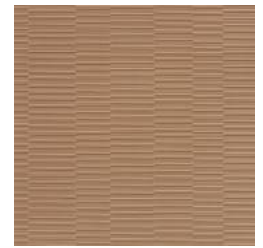
W2-ST-09 SHEER TAUPE