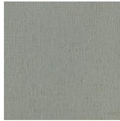
W2-SG-09 RIPPLE EFFECT