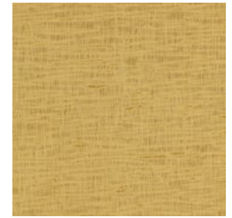
W2-SG-15 GOLDEN CHANNEL