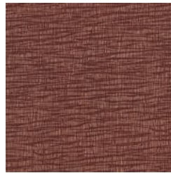
W2-SG-18 RUSTIC PATH