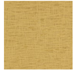
W2-SG-15 GOLDEN CHANNEL