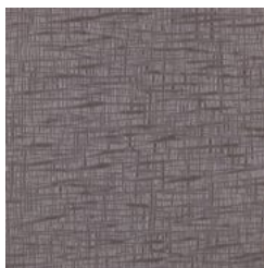
W2-SG-22 FAULT GREY