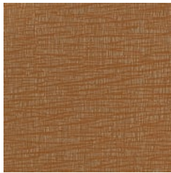
W2-SG-17 EARTHEN GROOVE