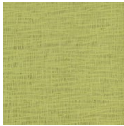
W2-SG-08 WILLOW CREEK