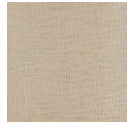
W2-SG-04 NATURAL SAND