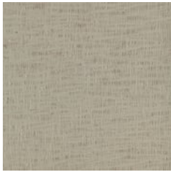
W2-SG-06 SEA VIEW