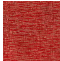
W2-SG-19 MOLTEN LAVA