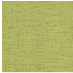
W2-SG-08 WILLOW CREEK