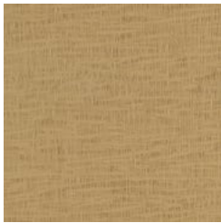
W2-SG-16 DESERT DUNES