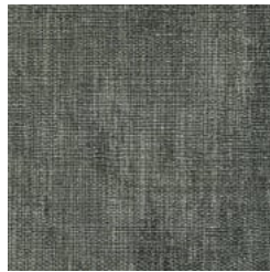
7022-98 HEAVY METAL