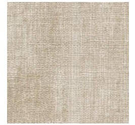
7022-33 NAKED TRUTH