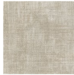
7022-31 ALL ACCESS