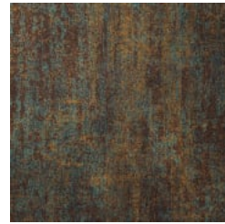
A170-612 AGED METAL