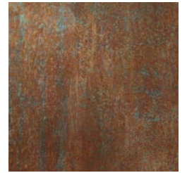
A170-697 RUSTED COPPER