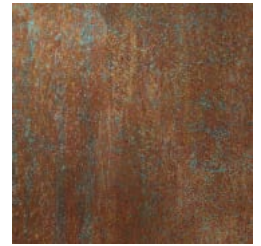
A170-697 RUSTED COPPER