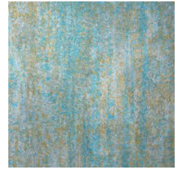
A170-395 SANTA FE