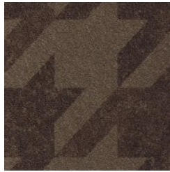
W122-07 BUSINESS CASUAL