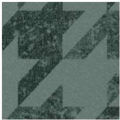
W122-10 FASHION WEEK