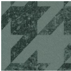
W122-10 FASHION WEEK