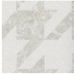
W122-02 COCKTAIL HOUR