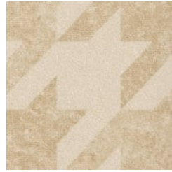
W122-03 ALL OCCASION