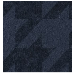
W122-08 EN VOGUE