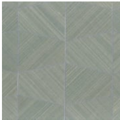
G0094HJ6030 LILY PAD