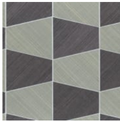
G0094HJ6026 BLACK AND WHITE