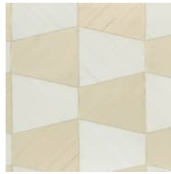
G0094HJ6027 OFF WHITE