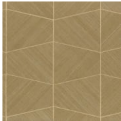
G0094HJ6031 WOOD THRUSH