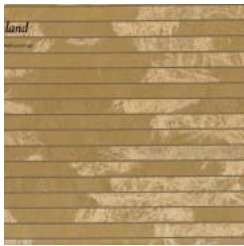
G0102HJ6070 SPRUCE YELLOW