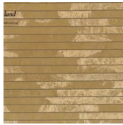
G0102HJ6070 SPRUCE YELLOW