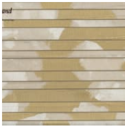
G0102HJ6073 AMBER GOLD