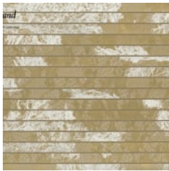
G0102HJ6072 GINKGO BILOBA YELLOW