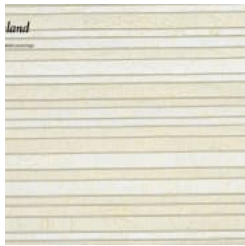
G0102HJ6071 PEAR WHITE