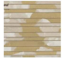
G0102HJ6073 AMBER GOLD