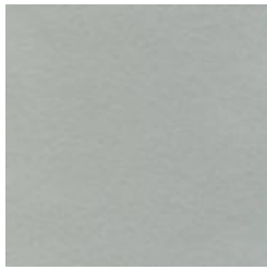
KR 54 94 SILVER THORN