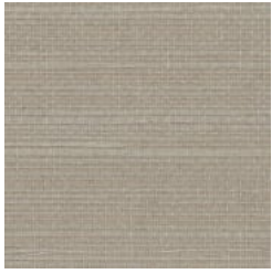
GL450-48 FOIL PRINT SILVER GRAY

Wallcoverings » Decorative Wallcoverings