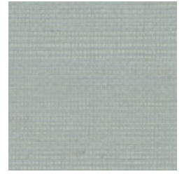
GL450-52 FOIL PRINT SILVER GEMSTONE BLUE