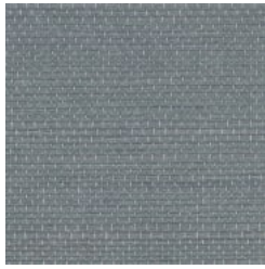
GL450-54 FOIL PRINT SILVER INK BLUE