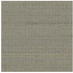
GL450-53 FOIL PRINT DARK GREEN GOLD