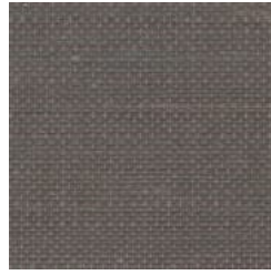
GL450-50 FOIL PRINT GOLD BRONZE