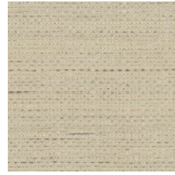
GL450-51 FOIL PRINT GOLDEN BEIGE