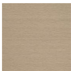
AZ51192 BURNISHED TAUPE