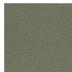
AZ53009 PINE NEEDLE