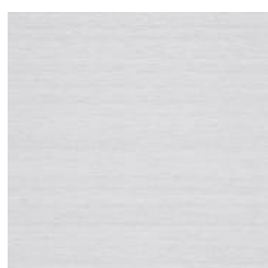
AZ53000 SOFT MIST