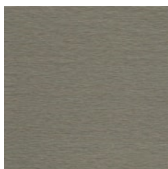
AZ51208 BLACKENED TEAL