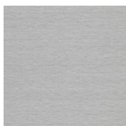
AZ53001 FULL MOON