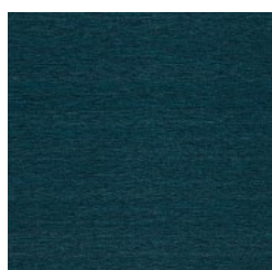
AZ53006 TROPIC NIGHT