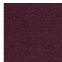
AZ53014 DEEP ORCHID